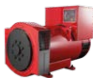
S4 / S5 / S6