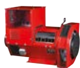
UC22 / UC27