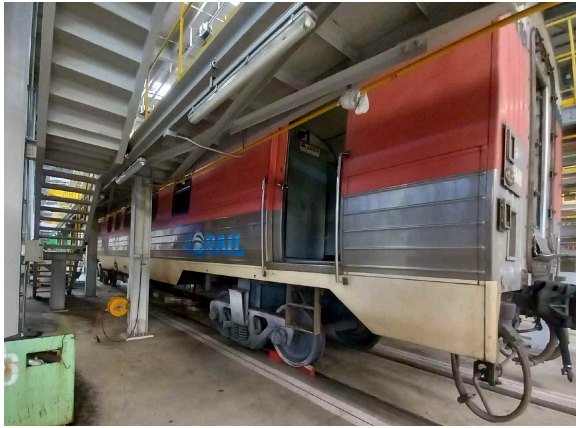
Korail repowering work