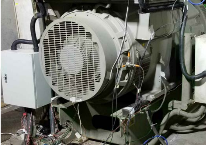
STAMFORD® S7HV working in harmony with the AvK® DIG120

The requirements to suit were for an alternator giving a total output of 10.5kV/1000kW working at an ambient temperature at below 40°C.