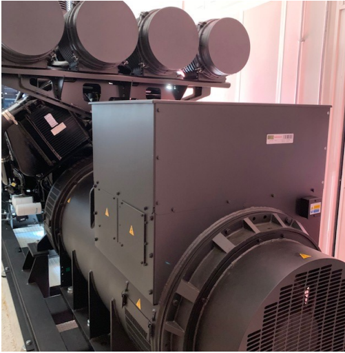
STAMFORD® P7G 2112 kVA alternators

The alternators needed to be able to withstand a harsh corrosive environment for this Welland Power chose STAMFORD® products.