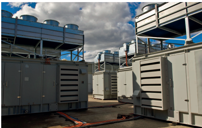
Gensets ready for shipment to Barrow Island from MPower's Ingleburn facility

Mpower selected NEWAGE® | STAMFORD® | AvK® as its alternator supplier for its proven and reliable products, reinforced by its experiences of working together since as far back as 1984. For the Gorgon Project, Mpower had specific requirements for staged delivery, DNV Certification and Closed Air Circuit Air (CACA) coolers. To provide the 24 MW of continuous power it needed, Mpower specified 12 x 2,750 kVA gensets - capable of delivering a total of 33 MW - equipped with MTU 20V400G63L engines and 11 kV AvK® DIG 140k-4L alternators.