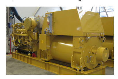
Pon Power Integration

the 3 x CAT 3512E variable speed engines with the AvK DSG 99's, stating "the focus from the owner has been efficiency, and we offer unrivalled efficiency with our combined package across the full generator set operating range."